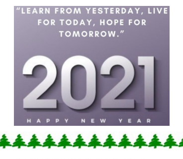
BURNESIDE PARISH COMMUNITY TREE PLANTING